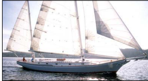
Covey Island Boatworks "Elsie" 57' Herreshoff Bounty/Tioga ketch