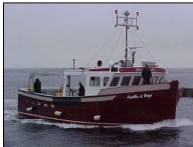
Caitlin & Boys Fishing vessel for Newfoundland customer