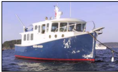
Nova Trawler 36

Another NSBA Silver Member, Nova Trawler Company , has also upgraded to Gold Member for this year.