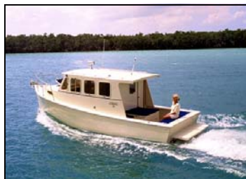
Aylward 25 Turbo Trawler

NSBA Silver Member Aylward Fibreglass has upgraded to Gold membership for 2005 / 2006. Aylward offers the unique "Grizzly" fishing vessel, billed as the largest 50ft mould in Nova Scotia. Aylward also offers a 25' turbo trawler for recreational use.