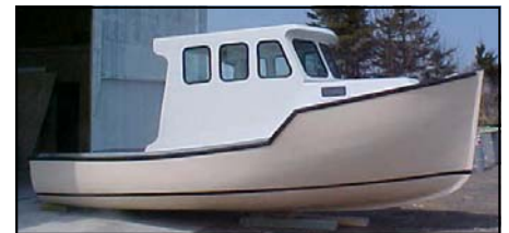
Apple Island 21 Cape Island outboard, for work or play

For more information on the Apple Island 45 , contact Wade Goulden at 902-637-3219 or visit NSBA's website and select Apple Island Marine from our list of members.